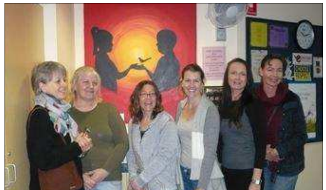
Open School event at Djidi Djidi. New volunteers find out about the HU4K programme and sign up to help.